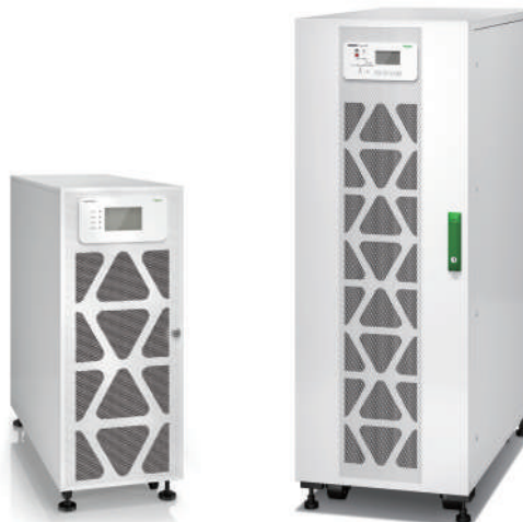
50 kVA Easy UPS 3M for external batteries

*Included with Easy UPS 3M; included for Easy UPS 3S 208V in most regions. Contact your local Schneider Electric representative for availability.