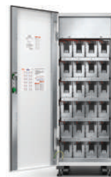
Modular battery cabinet for extended runtime requirements (compatible with Easy UPS 3S)